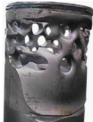
Single stage chokes have 1/5 the life expectancy of a 100DPC in severe service applications